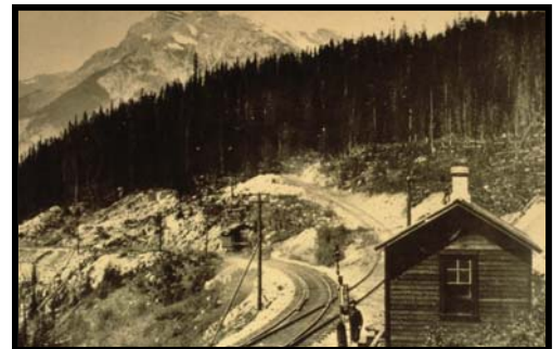
Main track with spur line to the right.

The steep grade in Kicking Horse Pass posed a serious challenge. Under government pressure to complete the railway, and given the engineering challenges that came along with the geography, Canadian Pacific was not in a position to carve a gradual descent. A solution was reached, which temporarily allowed a grade of 4.5%. The first train to attempt the hill in 1884 derailed, tragically killing three workers. In an effort to improve safety, three spur lines were created to divert such runaway trains on what became known as the “Big Hill”. Switches were left set for the spurs and were not reset to the main line until switchmen knew the oncoming train was in control. Descending the Big Hill was challenging, but uphill trains had their problems too. Extra locomotives were needed to push the trains up the hill, causing delays and requiring extra workers. Although the mountains were a complication for CP, they were an inspiration to the many tourists who started to arrive by train. In an effort to preserve the landscape and encourage tourism, CP prompted the creation of Mount Stephen Dominion Reserve in 1886. The park was renamed Yoho in 1901.